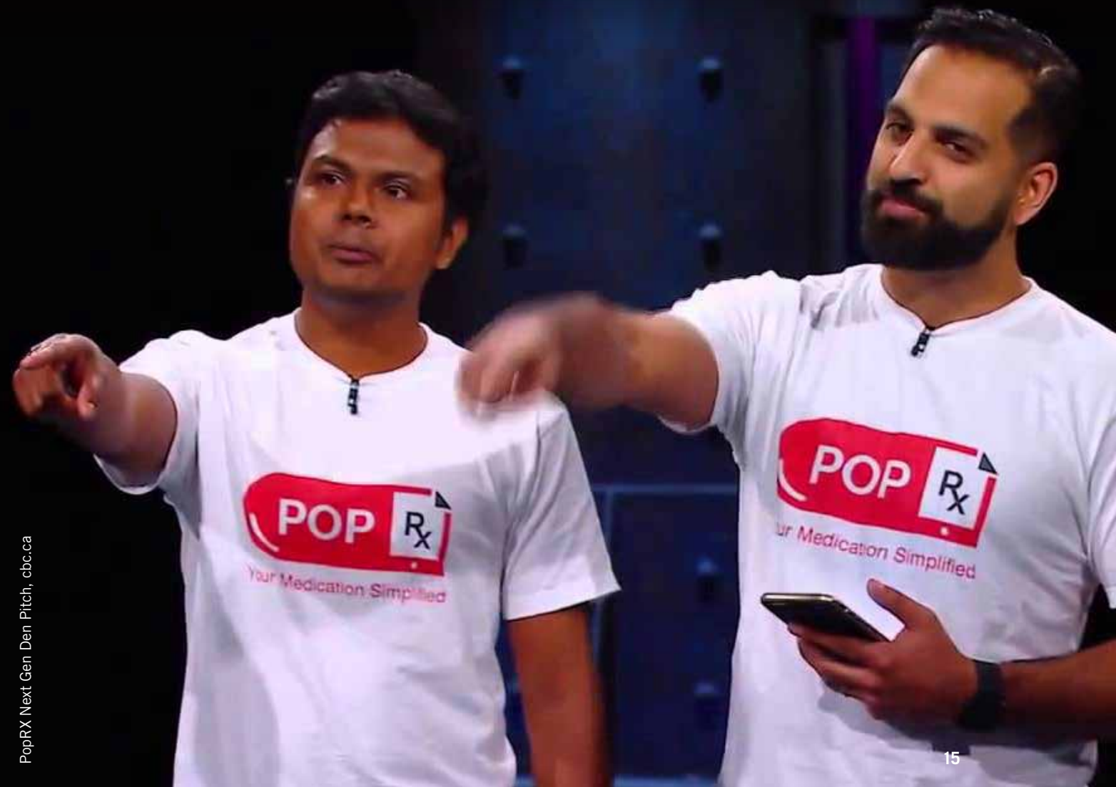
PopRX Next Gen Den Pitch