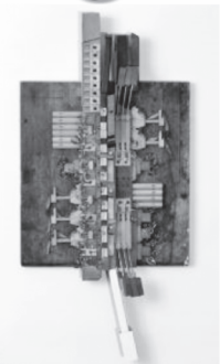
Displaced Pieces 66 - Peter Tittenberger

On display at the Sam Waller Museum from Nov. 4 —Nov. 29, 2019. Museum open daily from 1:00pm to 5:00pm. Standard admission rates apply and includes entrance to the Museum as well as the Children's Discovery Centre.